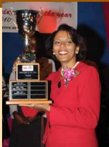
Principal of the Year 2009/2010 (Buff Bay High School)